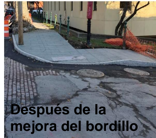
Después de la mejora del bordillo