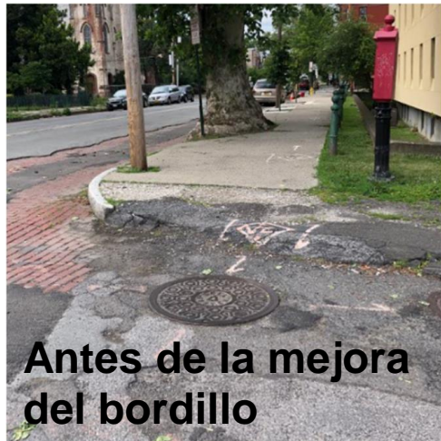
Antes de la mejora del bordillo