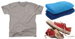
Textiles: Clothing, Shoes, Towels, etc. (any condition)