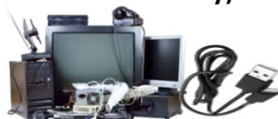
Electronics (or call City for bulk collection rules)