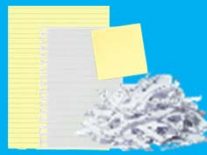
Paper (shredded OK)