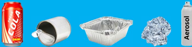
Metal Containers and Foil