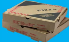
Pizza Boxes (clean)