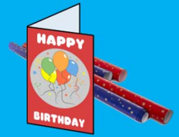
Greeting Cards and Gift Wrap