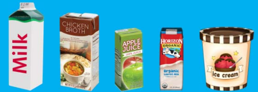
Cartons and Juice Boxes

Include caps and lids with commingled items. Please empty and rinse items.