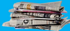
Newspapers, Magazines, Catalogs