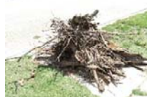
Yard Waste (New Hampton Transfer Station only)